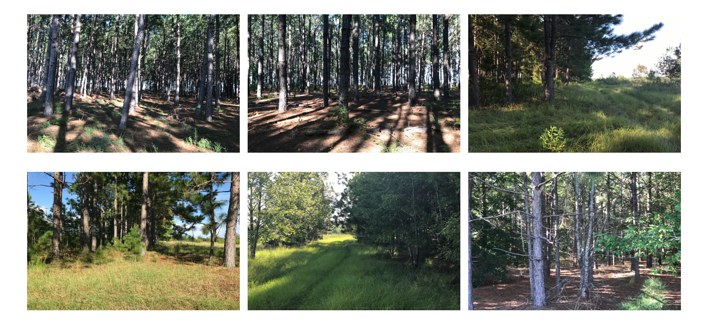
Hwy 17 Screven County, Georgia, 45 AC +/-

Highway 17 farm Published on Plantation Properties & Land Investments, LLC (https://www.landandrivers.com)