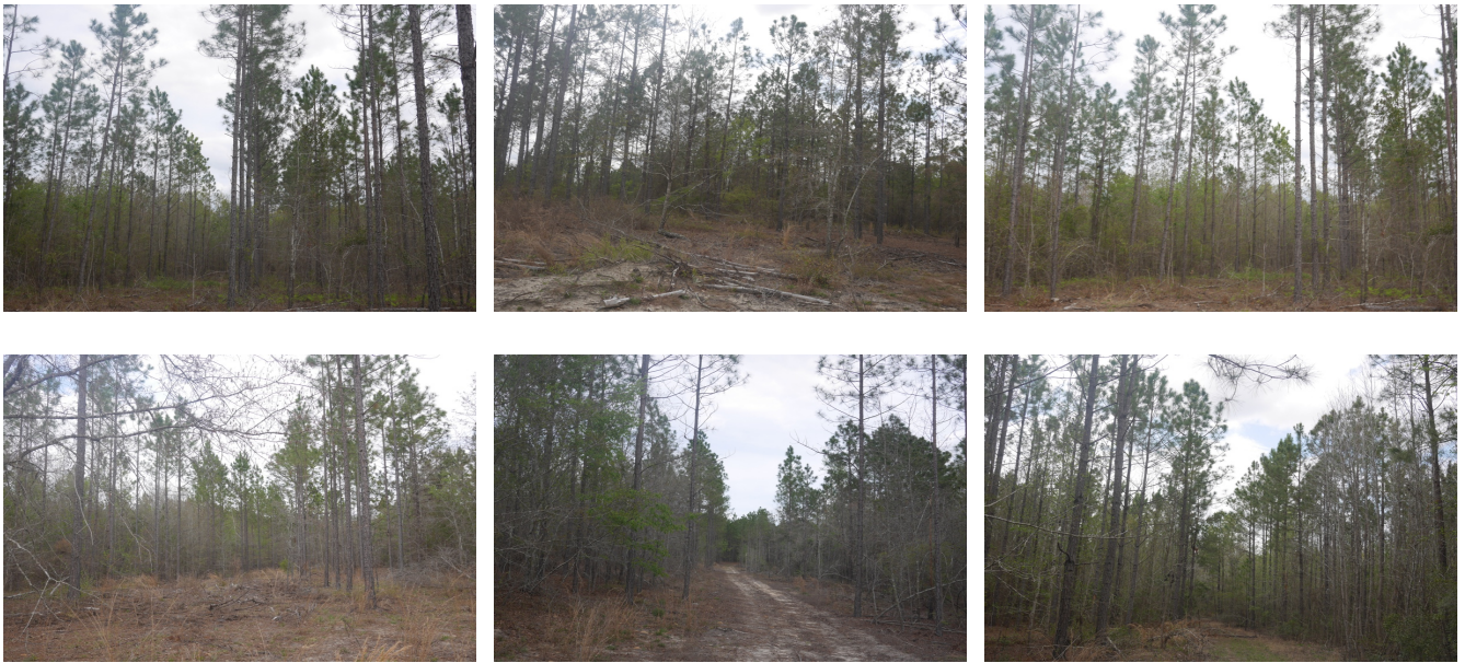
Rocky Ford Rd Bulloch County, Georgia, 132.0 AC +/-

Published on Plantation Properties & Land Investments, LLC ( https://www.landanddrivers.com )