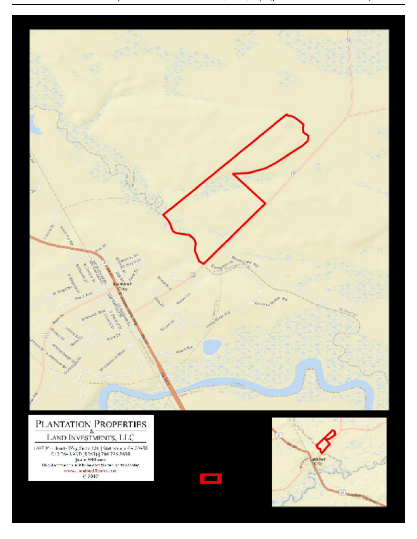
Source URL: <a href="https://www.landandrivers.com/property/little-ocmulgee-tract">https://www.landandrivers.com/property/little-ocmulgee-tract</a>