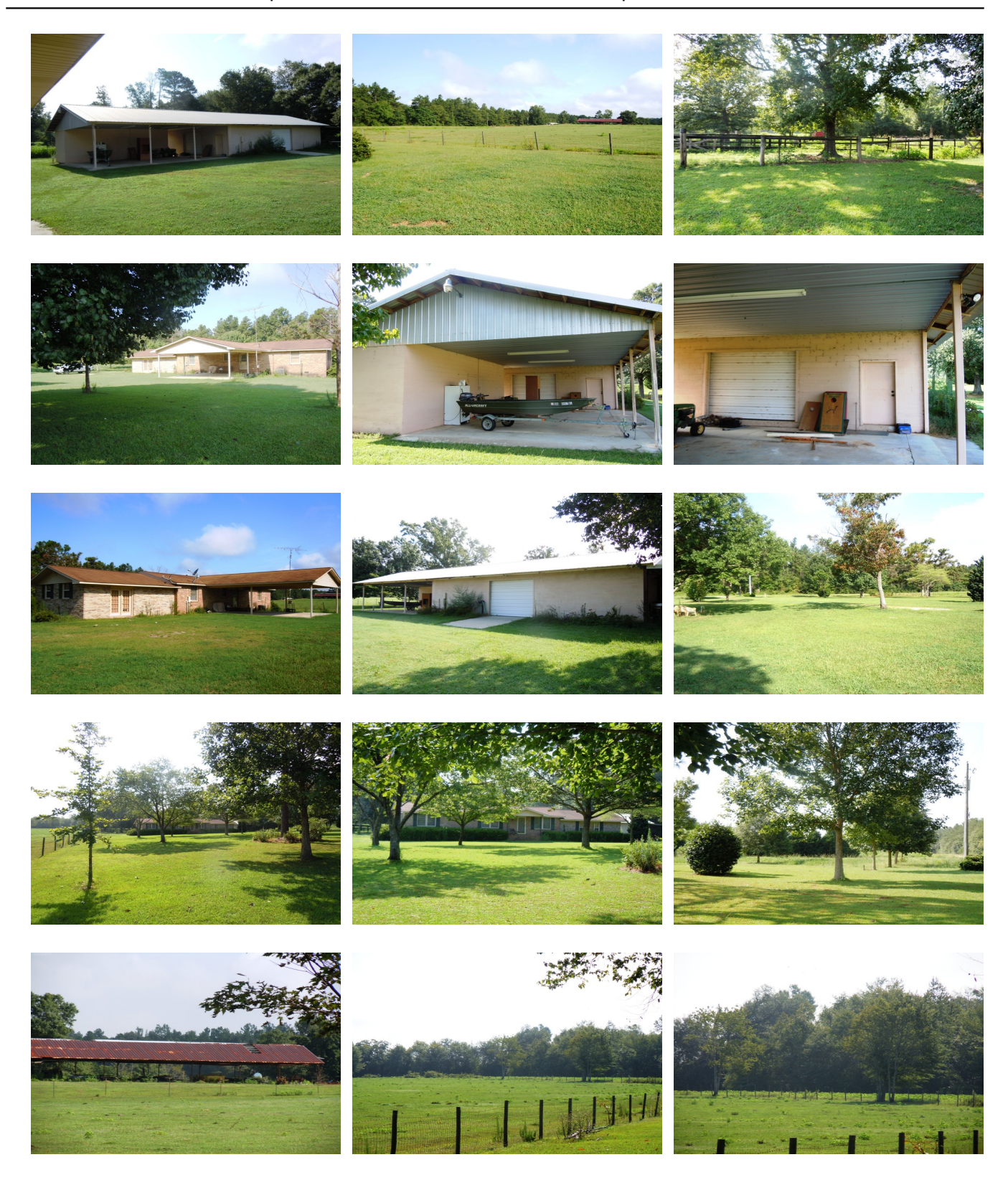
Lane Farm Published on Plantation Properties & Land Investments, LLC (https://www.landandrivers.com)