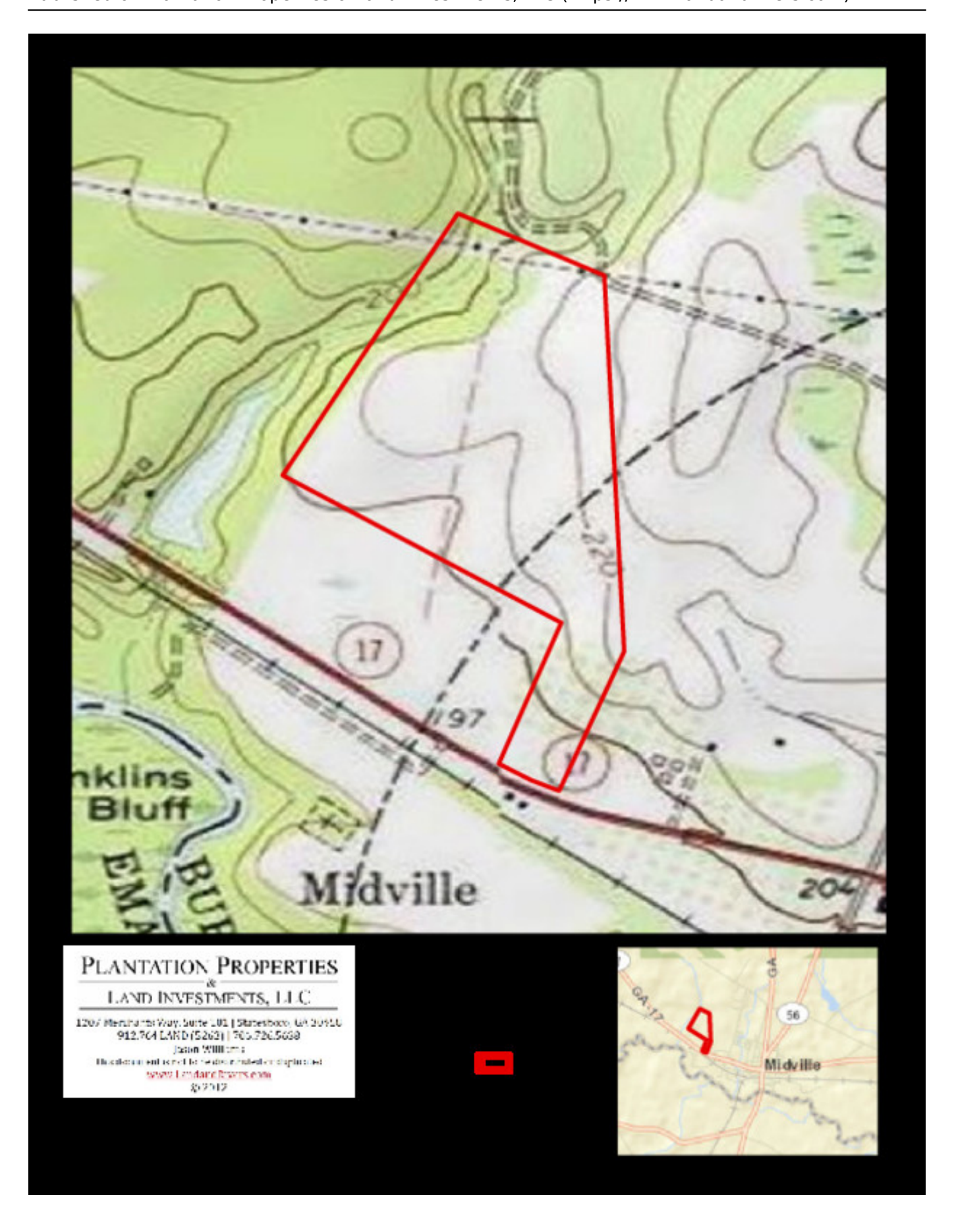
Source URL: <u>https://www.landandrivers.com/property/cattle-crossing</u>